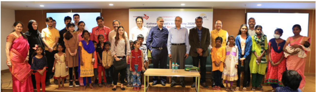
Beneficiary children, their families, donors, doctors, and the Aishwarya Trust team come together to mark 12 years of Aishwarya Trust.